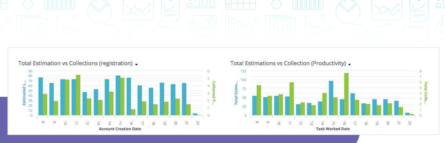
Quickly identify performance improvement opportunities through easy-to-use dashboards and analytics